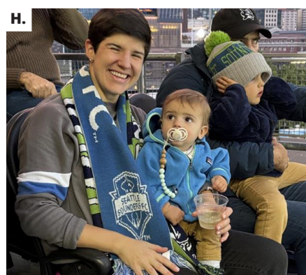
A-C: At our Boise Happy Hour in September, alumni and their families enjoyed mingling, refreshments and axe throwing. D-F: Our milestone alumni came together to reconnect and reminisce at Reunion Weekend in June — and looked dapper for our Roaring Twenties theme. G-H: In October, alumni and families cheered on the Sounders in the final match of the season against the Portland Timbers.